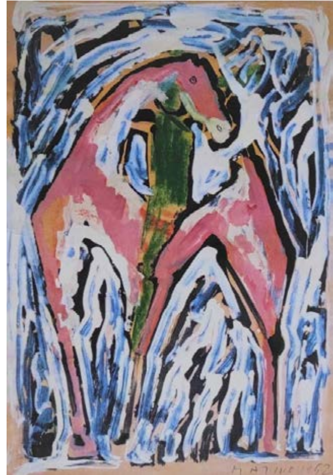
Marino Marini Cavallo rosa e cavaliere , 1952 Gouache on paper 62 x 43 cm

A painter by training, Marino Marini later decided to devote himself primarily to sculpture. In 1928 he moved to Milan, where he was called by Arturo Martini to succeed him as professor of sculpture at the Villa Reale in Monza, where he taught until 1940. He then moved to the Albertina Academy in Turin and later to the Brera Academy. During these years Marini's name and work became increasingly popular: he travelled and exhibited in various European cities, stayed several times in Paris, made contact with important modern artists, held his first solo exhibition (1932), participated in the Venice Biennale, the Milan Triennale and the Rome Quadrennial. In Marino Marini's work, painting, graphic art and drawing were constantly integrated and alternated with sculpture. His entire oeuvre is essentially developed around a few thematic nuclei that are constantly varied throughout his work: horses and riders, female nudes and pomones, dancers and jugglers. These images are emblematic not only of mankind, but also of the artistic repertoire, which, laden with allusions, reaches from prehistory and the ancient Etruscans to modernity, passing through Classicism and the Renaissance.