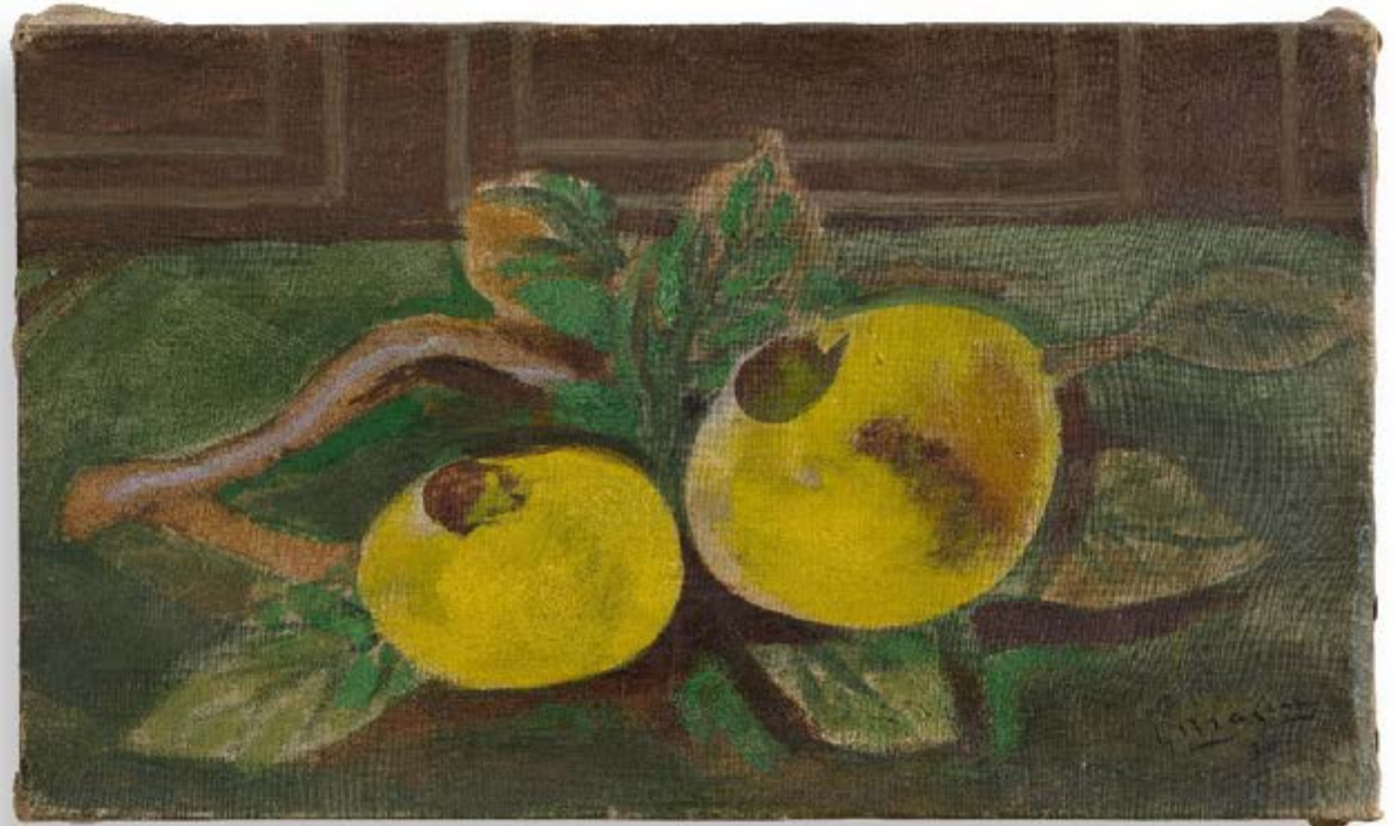
Georges Braque Citrons , 1939 Oil on canvas 19 x 32 cm

Georges Braque was a French artist who, along with Picasso, is regarded as the father of Cubism in the early 20th century. Born in France, his artistic training developed when he met Picasso while working on his extraordinary Les Femmes d'Alger and simultaneously rediscovered Cézanne. Braque devoted himself to “ papiers collés ”, in which he used fragments of real material directly, no longer to illude but to allude. He is also considered the father of Analytical Cubism: where all familiar forms are hidden in the painting, but more and more recognisable as the eye becomes accustomed to the fragmentation of the images and the opacity of the colours. In his move towards simplification and geometric forms, still lifes of tables with objects and musical instruments are the main subjects of most of his artistic production.